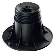
XL/87/150B h. 87-150 mm