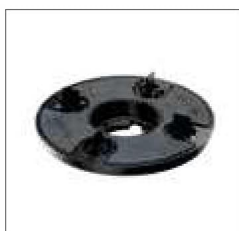
PPLM/T2 PPLM/T3 PPLM/T4